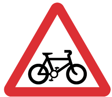
Diagram 650 Cyclists