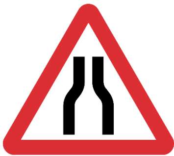
Diagram 516 Narrow Road

Types of signs that have been considered for use are: Regulatory Signs: