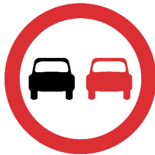
Diagram 632 No Overtaking